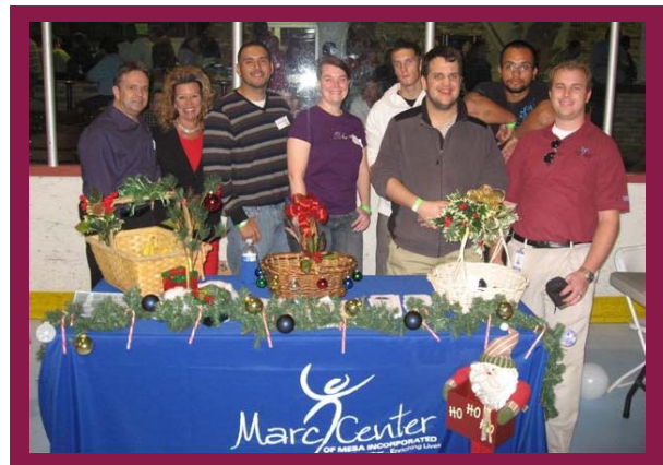
Staff and members attended the RIAZ Winter Wonderland Provider Fair on Friday, December 10. Marc Center had the most festive table.

Marc Center provides opportunities for people to be actively involved in determining where and how they live, learn, work and play.