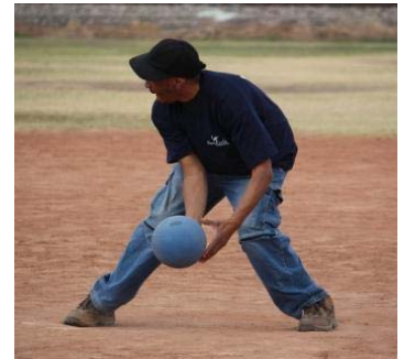
West Village stops another run.

Congratulations to all involved in this great BHS outreach.